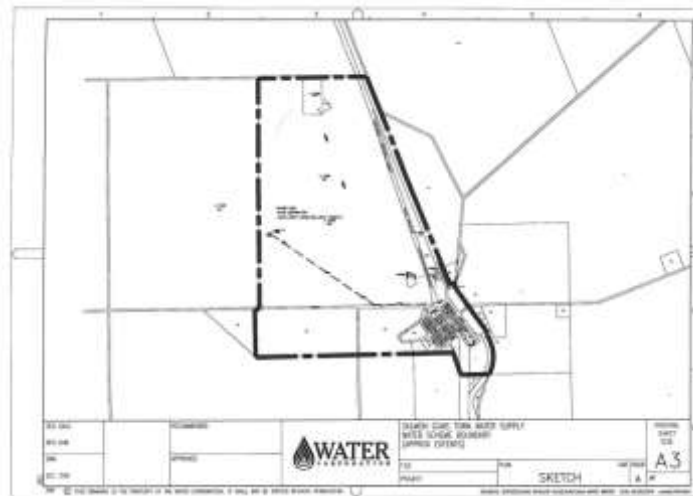
Map 3 — the Salmon Gums scheme water area