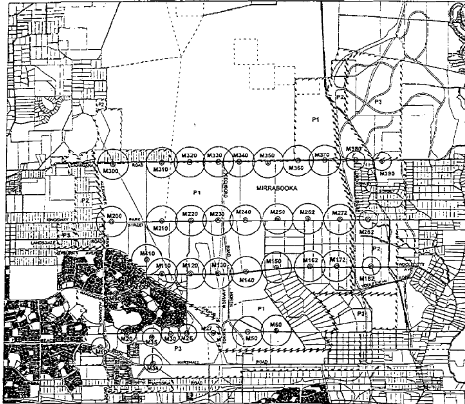
Plan 1 - Mirrabooka Underground Water Pollution Control Area