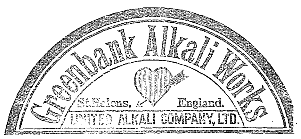
4th October, 1895.

Application No. P. \frac{3.6}{3.6} T.—The United Alkali Company, Limited, of No. 14 Exchange Buildings, Liverpool, England, to register in Class 1, in respect of Alkalies, a Trade Mark, of which the following is a representation:—