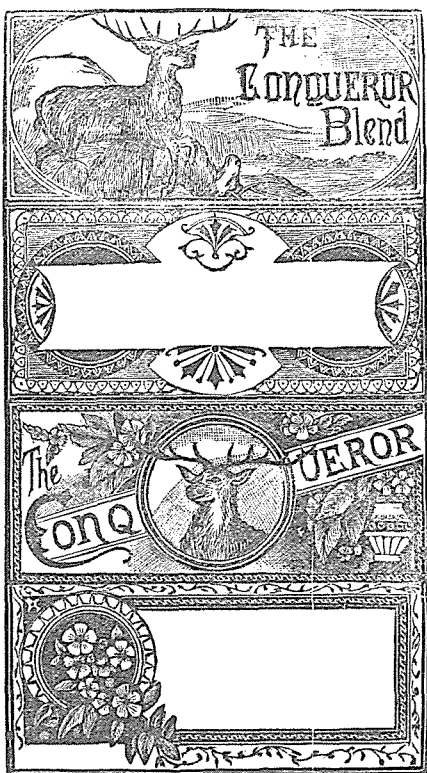
31st July, 1896.

Application No. P. \frac{9.6}{14.3} .—King, Engel, and McCullagh Limited, of William Street, Melbourne, in the Colony of Victoria, Merchants, to register in Class 42, in respect of Tea and all other goods contained in such Class, a Trade Mark, of which the following is a representation:—