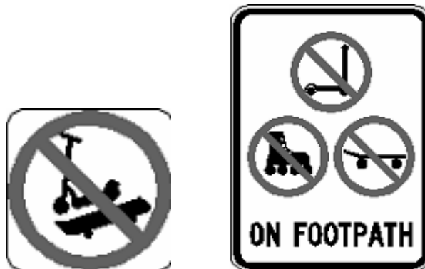
No wheeled recreational devices, scooters or toys signs