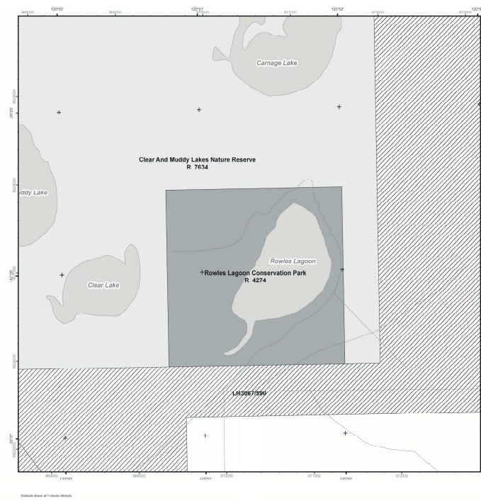
Rowles Lagoon Conservation Park

All that portion of land and waters comprising reserve number 4274, described as Lot 44 on Deposited Plan 255985 and comprised in Certificate of Title Volume LR3055-396. For information purposes, the prescribed area is shown below.