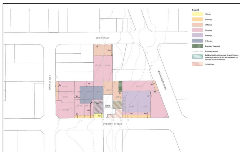
Figure 6: Maximum height of buildings on Site 'S'