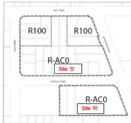
Figure 5a: Location of Site 'S' and Site 'R'