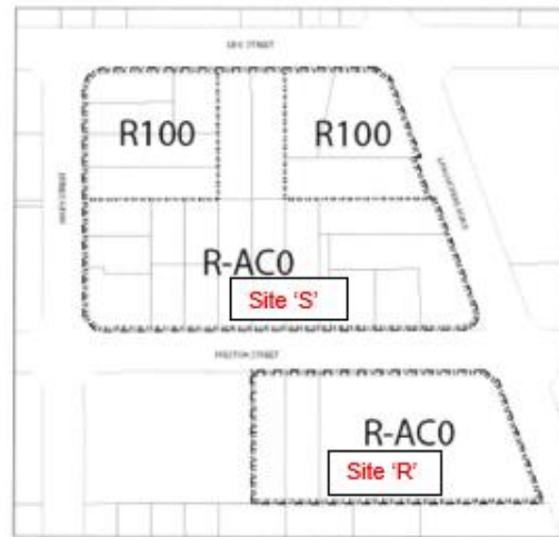
Figure 5c: Location of Site 'S' and Site 'R'