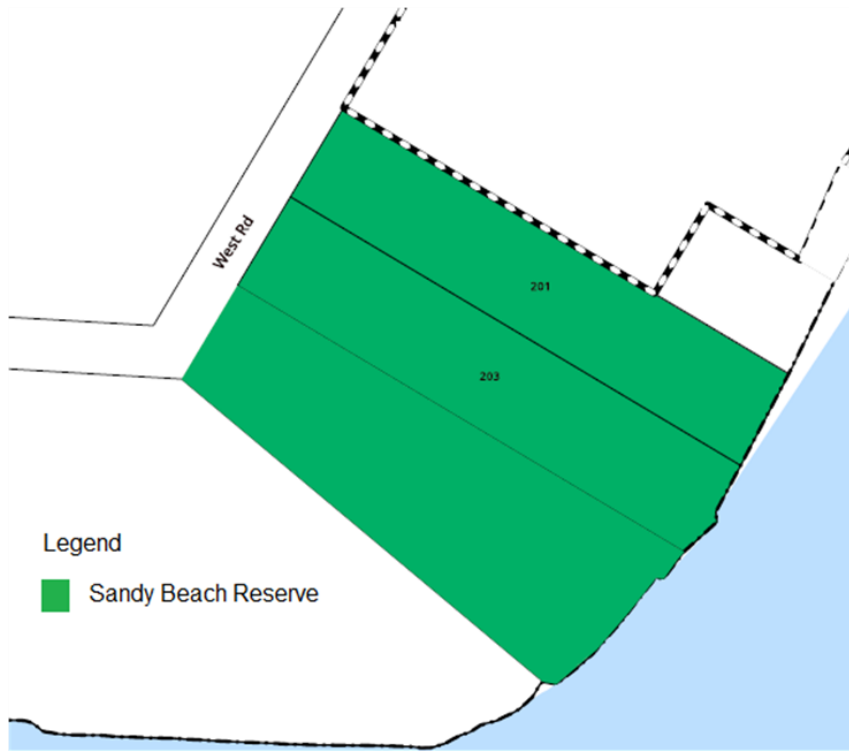
Map 3—Sandy Beach Reserve, cat prohibited area