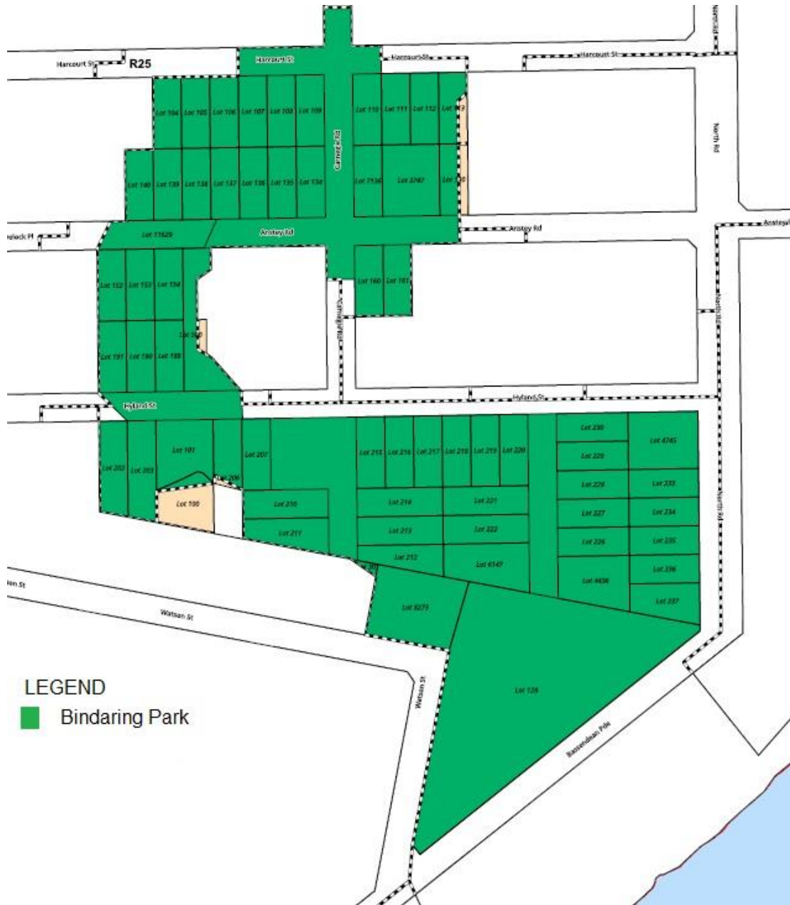
Map 1—Bindaring Park, cat prohibited area