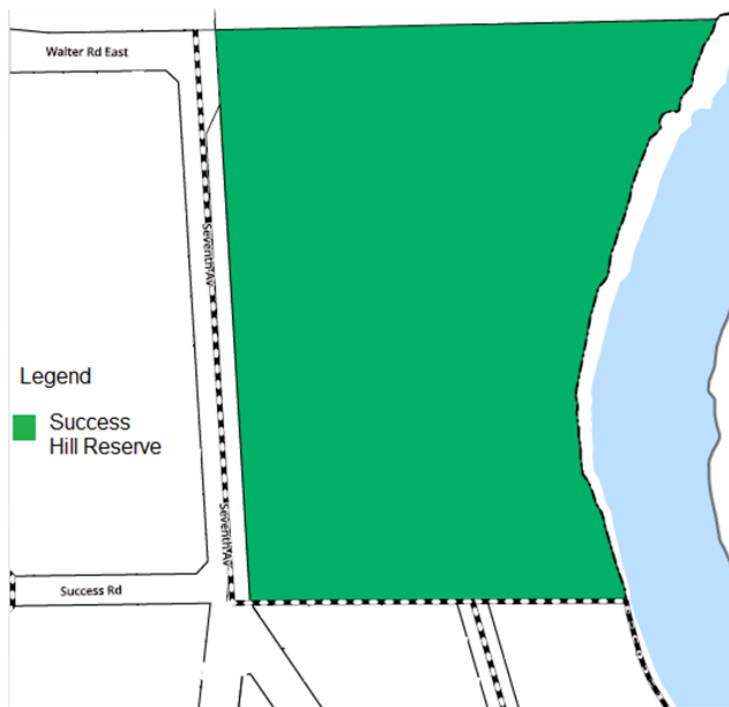
Map 4—Success Hill Reserve, cat prohibited area