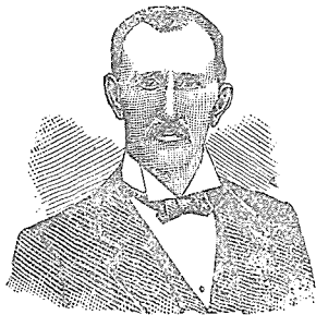
THE DENTAL KING.