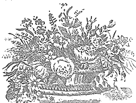
LA CORBEILLE FLEURIE