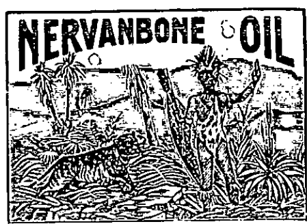
THE GREAT AFRICAN REMEDY.

Medicinal Preparation, a Trade Mark of which the following is a representation:—