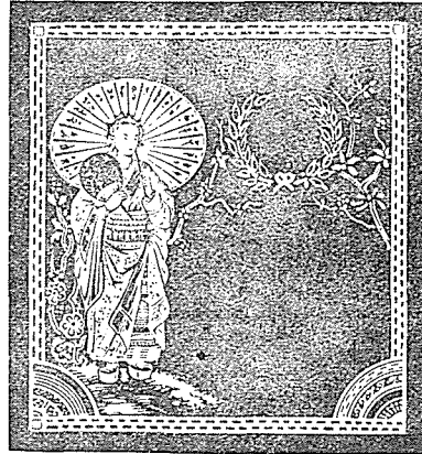
The essential particular of the Trade Mark is the distinctive device.

Application No. 2831, dated 2nd June, 1903.—GERSTENDORFER BROTHERS, of 43 Park Place, New York, United States of America, Manufacturers, to register in Class 1, in respect of Paints, Enamels, Varnishes, Lacquers, and Aluminium and Bronze Paints and Powders, a Trade Mark, of which the following is a representation :—