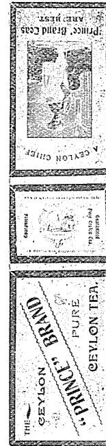
The essential particular of the above Trade Mark consists of the distinctive label.

respect of Tea, Coffee, Cocoa, a Trade Mark, of which the following is a representation :—