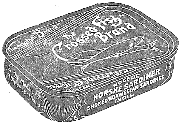
The essential particulars are the combination of devices and the words "Crossed Fish."

Application No. 3718, dated 10th May, 1906.—STAVANGER PRESERVING COMPANY, Stavanger, Norway, to register in Class 42, in respect of Substances used as food or as ingredients in food, a Trade Mark, of which the following is a representation:—