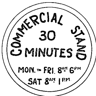
Figure 3D (1). [Reg. 355A (3) (a).]