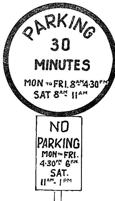
Figure 3F—Parking Sign with Peak Period Restrictions.

This sign as shown in Figure 3F shall consist of a white disc essentially the same with regard to its size and colouring and the size and colouring of letters and numerals thereon as the Figure 3E. The rectangular plate placed beneath the disc shall be essentially the same as the rectangular plate so placed in Figures 3D (3) and 3D (4).