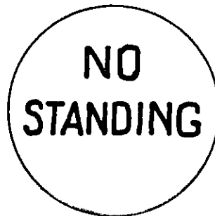
Figure 3A—No Standing Sign.

This sign shall consist of a red disc as shown in Figure 3A approximately 18 inches in diameter and having in the centre the words "NO STANDING" painted thereon in white letters 3 inches high.