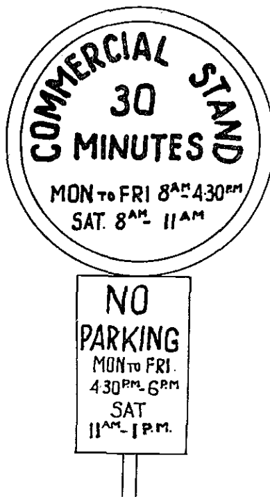
Figure 3D (3). [Reg. 355A (3) (c).]