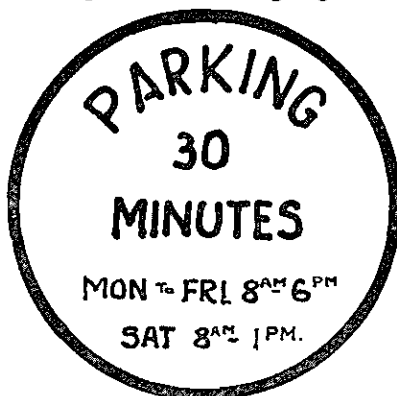
Figure 3E—Parking Sign.

This sign as shown in Figure 3E shall consist of a white disc approximately 24 inches in diameter with a ¾ inch wide black border, having the word "PARKING" in letters 3 inches high together with the days and times in letters and numerals 1½ inches high painted in black thereon. The parking limit "30 minutes" shall consist of letters and numerals painted in red 2½ inches high.