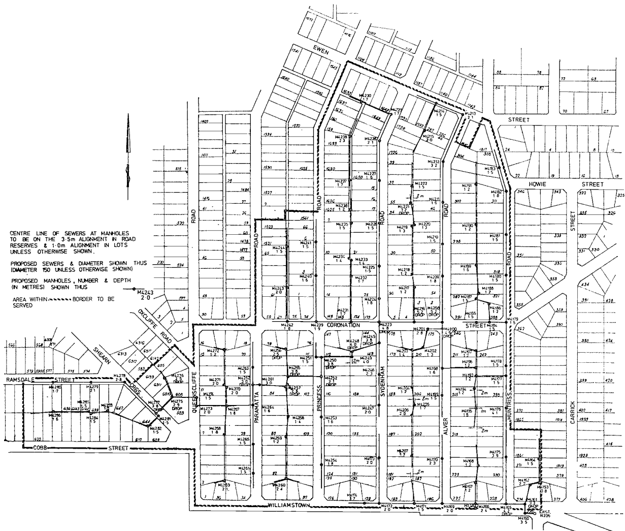
METROPOLITAN SEWERAGE RETICULATION AREA 10A WOODLANDS M.W.B. 13028