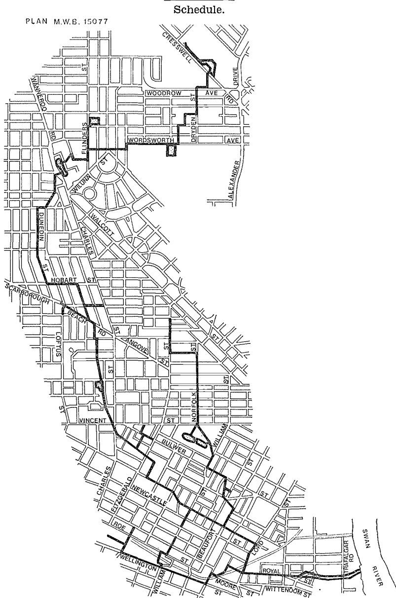
CLAISEBROOK DRAIN AND COMPENSATING BASINS

NOTICE is hereby given in pursuance of section 71c of the Metropolitan Water Supply, Sewerage and Drainage Act 1909-1977 that the Metropolitan Water Supply, Sewerage and Drainage Board deconstitutes the Claisebrook Main Drain and all branches as previously gazetted and described in the Government Gazettes of 14th June 1957 and 26th July 1963 and constitutes as a Metropolitan Main Drain that drain inclusive of compensating basins, whose route is shown on the accompanying Schedule. The assigned name of that drain shall be the Claisebrook Main Drain.