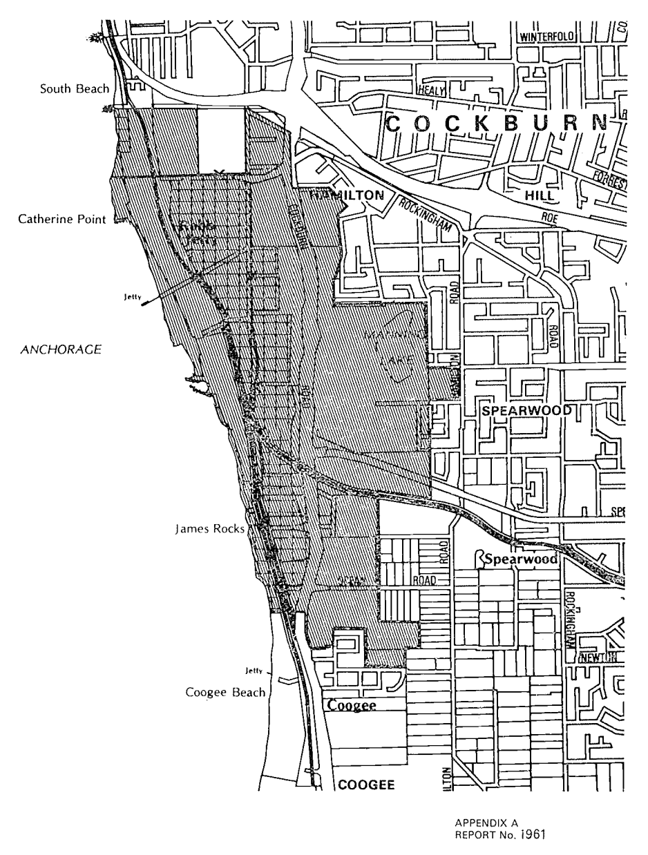
PART OF METROPOLITAN REGION SCHEME MAP No. 19, 23

All areas of land contained within the boundary of the Coogee Coastal Study Area as shown stippled on the plan hereunder.