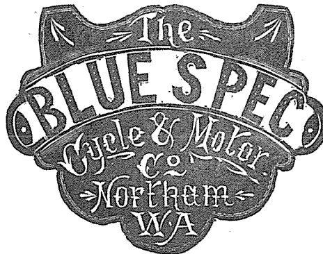
The essential particulars of the Trade Mark are the device and the words "Blue Spec."