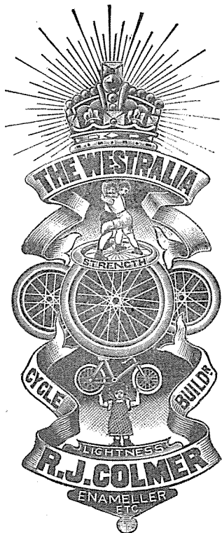
The essential particular of the Trade Mark is the distinctive label.