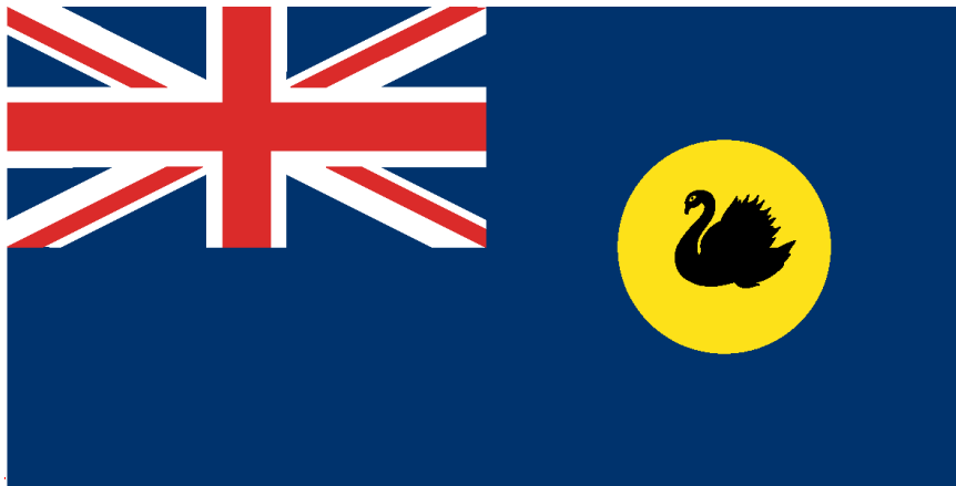
THE WESTERN AUSTRALIAN STATE FLAG

[Heading inserted: No. 19 of 2010 s. 36(3)(a).]