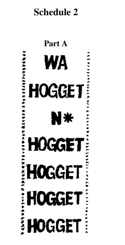
* Numeral authorised by Authority

Compare 09 Oct 2021 [05-f0-00] / 11 Mar 2022 [05-g0-00] Published on www.legislation.wa.gov.au