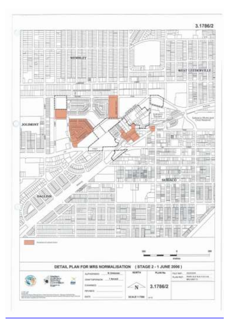
[Schedule 1 inserted in Gazette 17 Nov 2006 p. 4764-5.]