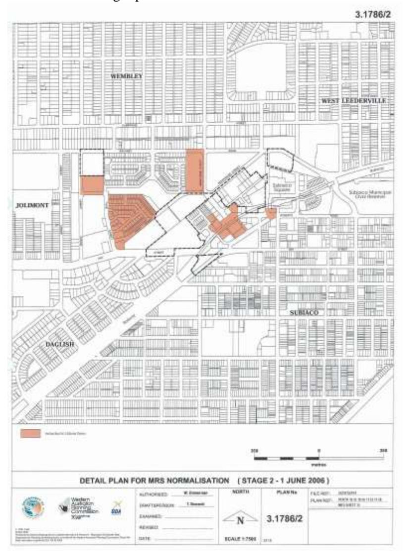
[Schedule 1 inserted in Gazette 17 Nov 2006 p. 4764-5.]

All of the land outlined by a broken black and white line on Plan No. 3.1786/2 held at the office of the Authority. For guidance, the redevelopment area is indicated in the following representation of Plan No. 3.1786/2 —