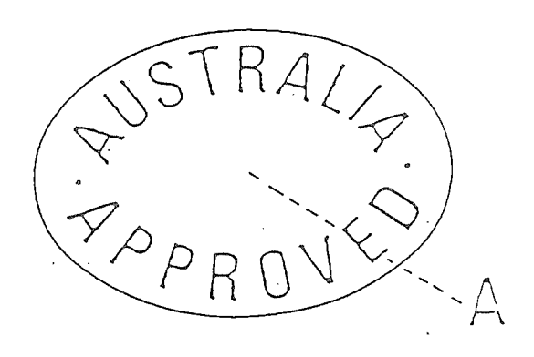
Where "A" is the registered establishment number.

"game carcass" does not include a game carcass which bears the official mark specified in paragraph 87 (q) of the Prescribed Goods (General) Orders of the Commonwealth and illustrated below.