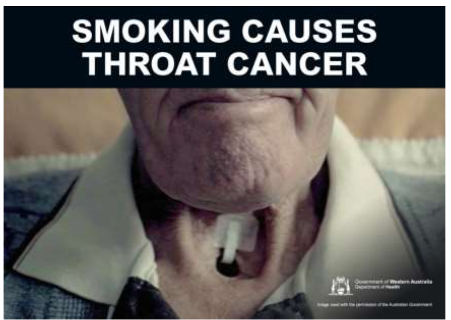
[Schedule 2 inserted: Gazette 12 Mar 2019 p. 662-3.]