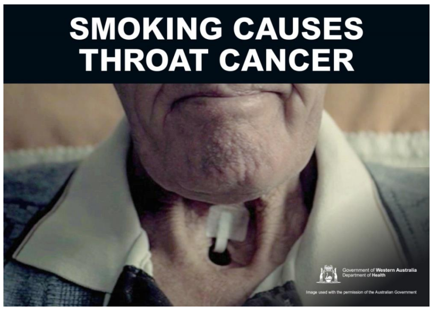
[Schedule 2 inserted: Gazette 12 Mar 2019 p. 662-3.]