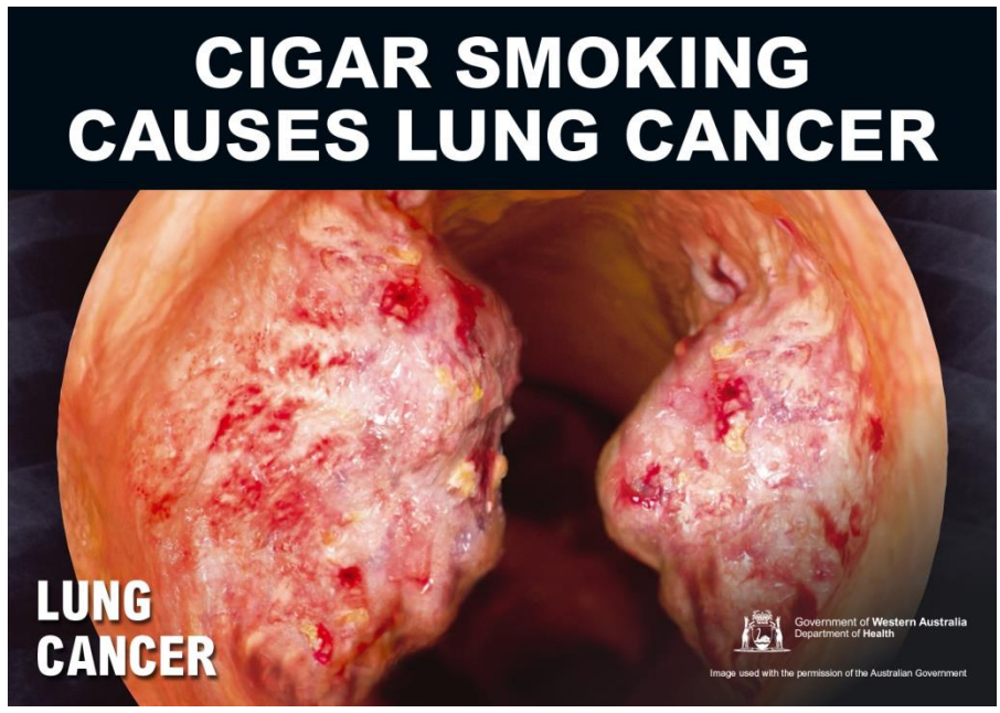
[Schedule 3 inserted: Gazette 12 Mar 2019 p. 664.]

[Heading inserted: Gazette 12 Mar 2019 p. 664.]